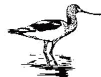
Saskatoon Nature Society

To register or for more information call 975-3042 (This is an answering machine which is checked frequently throughout the day) or send an e-mail to saskatoonnaturekids@gmail.com . Space is limited on most programs so advanced registration is required. Registration is taken on a first-come basis. You can register at any time.